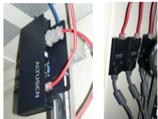
KA9140 (left) connected to serial machine and KA9120 (right) connected to computer with PS/2 interface

"If its price was low but it did not have the required functions, we would have to consider products