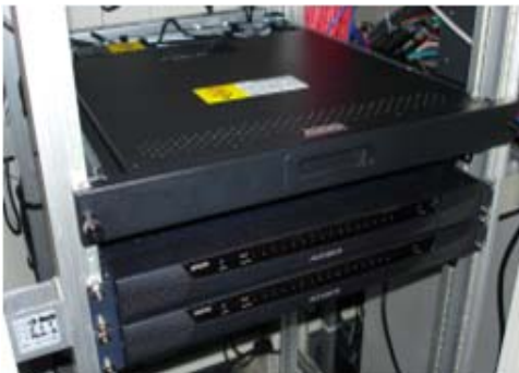
KN2116 (2 sets) installed on server rack

Provide users with a convenient operating environment with a comprehensive response mechanism and high degree of security