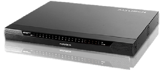
KN2116 16-Port KVM Over the NET™